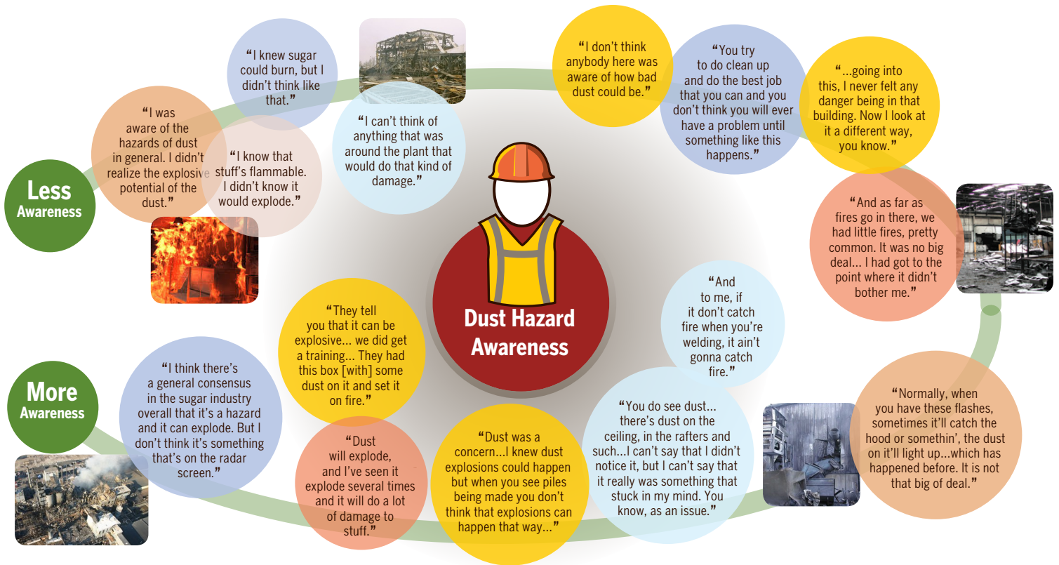
Figure 1. Interview excerpts of employee perceptions of dust hazards from Didion and prior CSB combustible dust investigations. Each quote bubble color represents a separate incident.